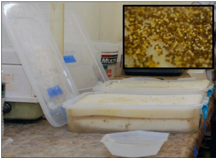
Figure 5. Storage totes containing wetted foam for air incubation of Gulf killifish, Fundulus grandis eggs (inset).

environment. These eggs then hatch when the tides return between 13 to 15 days later. Aquaculturists can take advantage of this unique adaptation within Fundulus spp. by incubating cohorts of collected eggs in a similar way. Batches of eggs can be placed on foam mats (expanded polystyrene or soft hobby foam) that have been previously soaked in 7 to 9 ppt salinity water. Foam of a similar size should be placed on top of a single layer of eggs to form a sandwich that can be placed within a container, e.g., small storage tote (Fig. 5). The salinity of the incubation water used to keep the foam wet (i.e. spray bottles) can be increased (up to 18 ppt) to reduce fungal/mold/bacterial formation on the eggs throughout incubation. Air incubation reduces the protracted hatch time observed in water incubation and reduces the likelihood of larger larvae consuming younger and smaller individuals.