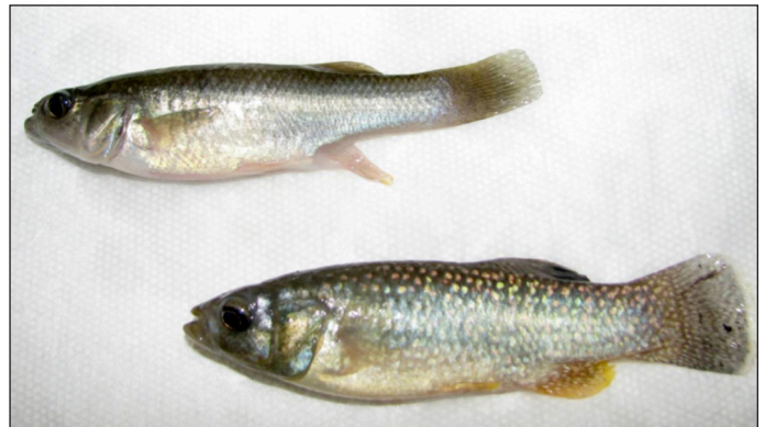
Figure 1. Adult female (above) and male (below) Gulf killifish, Fundulus grandis . Males are identified by their speckled sides and white fin margins while females have an olive drab coloration.

The majority of bait sales for Gulf killifish currently originate from wild harvest. A survey on Gulf killifish sales conducted at marinas and bait shops within Louisiana indicated that approximately half (53 percent) of bait sellers were unable to meet the demands of anglers, even when using multiple suppliers (2 to 3). Seasonal availability and inconsistency of harvest throughout the range of this species has been apparent since the 1970s when research on the culture of Gulf killifish began. Initial research on pond growth, feeding, and fertilization strategies for Gulf killifish began in 1976 at the Claude Peteet Mariculture Center at Gulf Shores, Alabama. Since that time, research expanded pond based culture methods including stocking densities, broodfish spawning techniques, and three-phase growing systems (see SRAC Publication No. 1200, Growing Bull Minnows for Bait ).