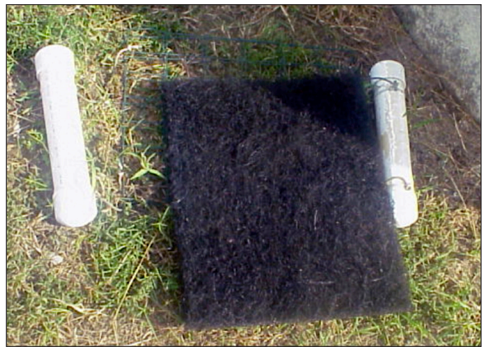
Figure 4. Spawntex® mat used for Gulf killifish, Fundulus grandis egg collection is suspended in tanks using capped PVC as floats.

There are a number of considerations for increasing egg production outside of sex ratios and stocking density in RAS and outdoor tanks. When using outdoor tanks the use of greenhouse shade cloth over approximately 80 percent of each tank has been demonstrated to increase the number of viable eggs collected during the summer months of egg production. Shade cloth can also be used in conjunction with netting to restrict access to the tanks by birds and other predators. Placement of spawning substrate in these tanks is similar to the placement of spawning mats in ponds. Mats cut to dimensions of 12 × 18 inches (30 cm × 45 cm) made of Spawntex® are